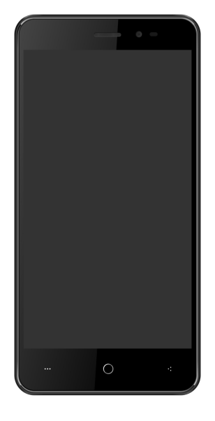
S5060 Duo 4-core IPS Quick Guide