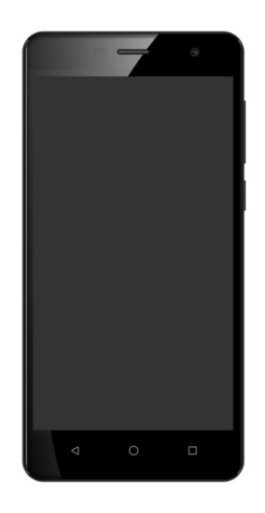
S5062 Duo 4-core IPS