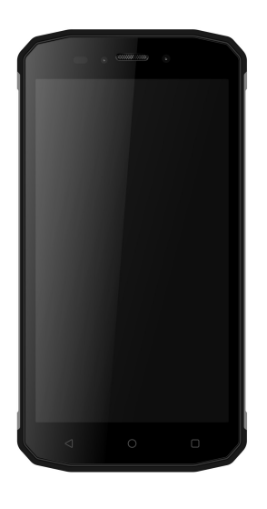
RX600 Duo 4-core IPS Quick Guide