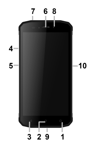
1. Button APK